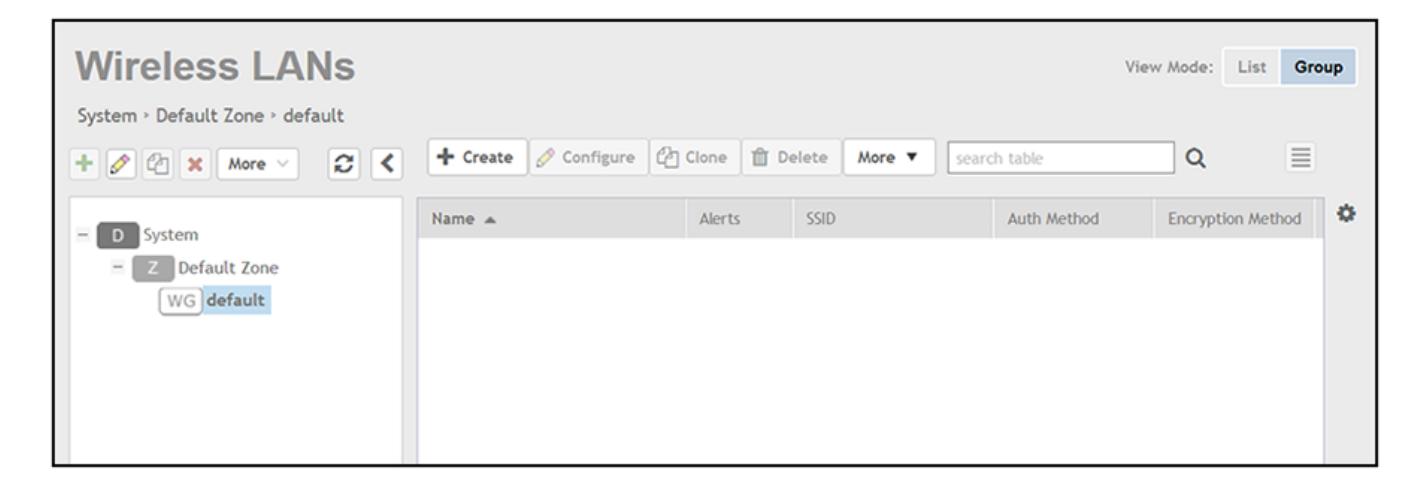
FIGURE 1 Wireless LANs Screen

3. On the Wireless LANs screen, highlight the desired zone, then click the + Create button.